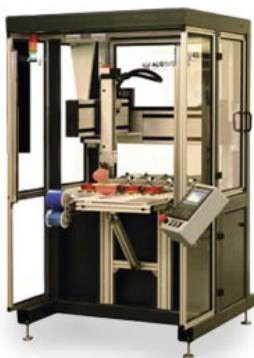
1 Unit CNC High Precision Programmable 5 Color 5" Image area.