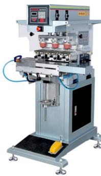
1 Unit 3 Color 3" Image