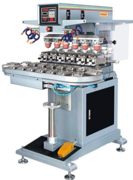
1 Unit 6 Color w/ conveyor 2" image