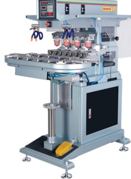
1 Unit 4 Color w/ conveyor 3" image