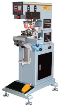
1 Unit 2 Color 3" Image