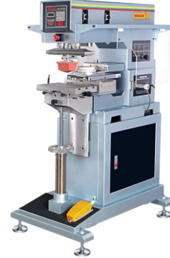
1 Unit Single Color 5" Image