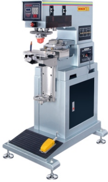
3 Units Single Color 3" Image