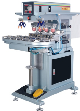
1 Unit 4 Color w/ conveyor 2" image